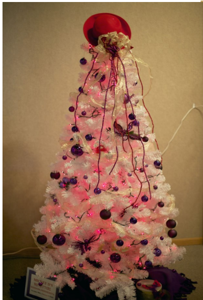
First Place—Mickey D's Red Hatters