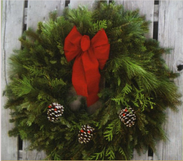
24" Wreath w/mixed greens, cones, & red velvet bow