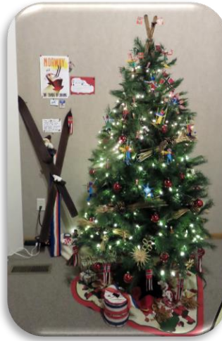
Left: 1 st Place Windom FFA