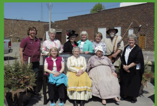
3 rd Grade Tour Volunteers & Staff-2016

The 3 rd grade annual visit to the Cottonwood County Historical Society, Courthouse and Law Enforcement Center is planned for May 10 th and 11 th . Students from throughout the county visit the museum to see the Archaeologist, the Pioneer Lady, the Aristocratic Lady, the Rural School Teacher, the Fireman and the Fur Trapper. They then view the Cottonwood County Courthouse and Law Enforcement Center. Thank you to our volunteers for making this a great experience for Cottonwood County 3 rd graders.