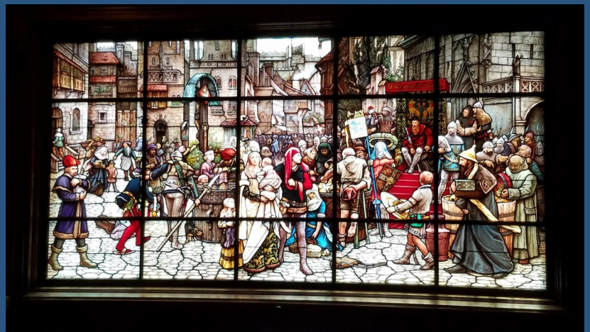
American Swedish Institute Stained Glass Window

Our third history bus tour set out to Minneapolis to see a temporary exhibit at the American Swedish Institute entitled "The Vikings Begin". On the way, we enjoyed a stop at the Norway House and a tour of the Mindekirken Norwegian Lutheran Memorial Church where services are still held in Norwegian. This tour was co-sponsored by the Sons of Norway.